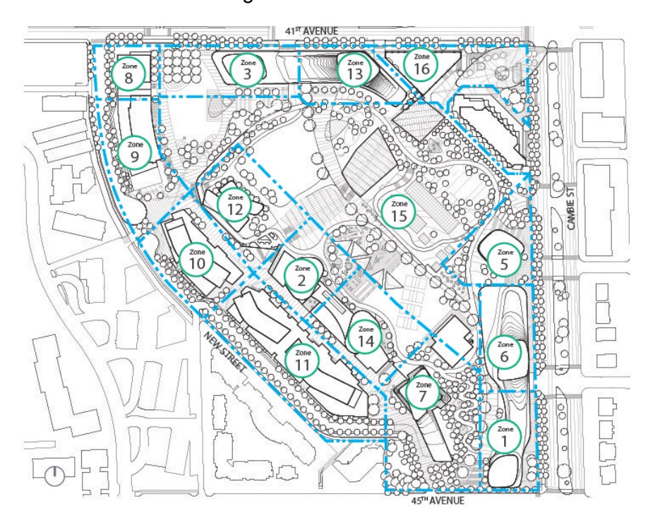
Figure 1 – Sub-Areas

3. The site is to consist of 15 sub-areas approximately as illustrated in Figure 1, solely for the purpose of allocating height.